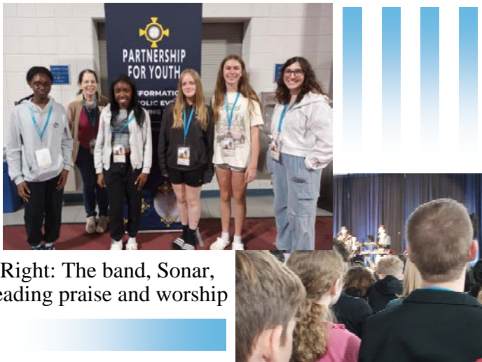
Right: The band, Sonar, leading praise and worship