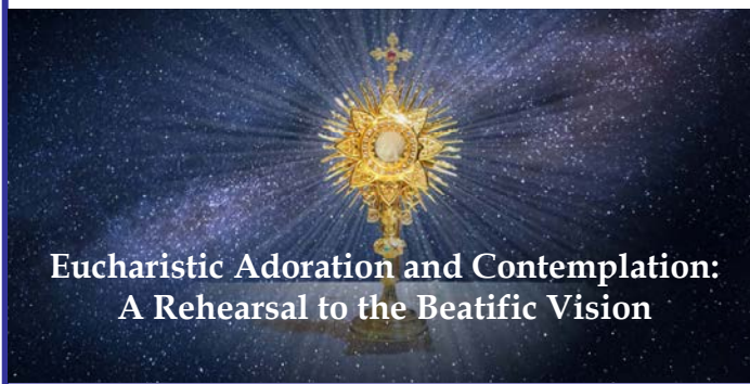
Eucharistic Adoration and Contemplation: A Rehearsal to the Beatific Vision