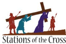
Stations of the Cross

Student Volunteers are Needed for RF Stations of the Cross on Good Friday at 7:00, April 15. If your child is interested in being part of the Good Friday Stations of the Cross, please call Christine at 630-910-0770 or email cgoba@rcdoj.org