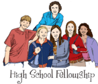
High School Fellowship

Please pray for our Confirmandi as they prepare to receive this most important Sacrament.