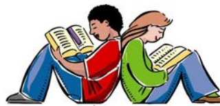
Know Your Faith, Live Your Faith

We are of building a community of high school students who are committed to building their personal relationships with Jesus Christ. If you are interested in learning more about our