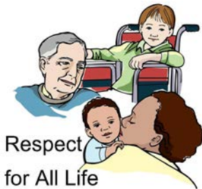
Respect for All Life

The Respect for All Life Committee will meet at the church, after mass (about 9:00 am), on Tuesday, September 11. All are welcome to attend this meeting. Come to find out what the Committee does, share your love of the Gift of Life, and plan for future events. The meeting will take place in the meeting room, first door on the right in the hallway.