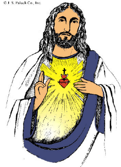
Most Sacred Heart of Jesus