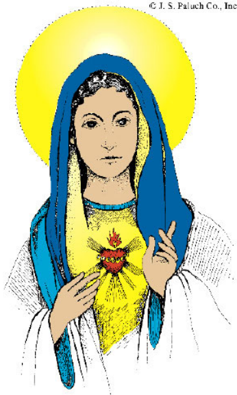
Immaculate Heart of Mary

Pope Francis' Tweet for the Week Let's always remember that our faith is concrete: the Word became flesh, not an idea!