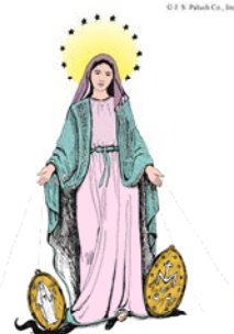
Our Lady of Grace

Do you wear a Miraculous Medal? The Association of the Miraculous Medal located in Perryville, Missouri, has a goal of sharing one million Miraculous Medals throughout the United States by the date of our Lady's birthday, September 8. If you would like to share in this exciting goal for the Year of Mercy, please call 1-800-264-MARY or visit us online at www.amm.org