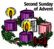
Second Sunday of Advent

No classes this week - Feast of the Immaculate Conception, Tuesday December 8th