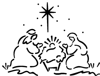
Night of the Nativity

Note that the 4:00 pm and 10:00 am masses have two extra Extraordinary Ministers of Communion assigned. The two extra communion stations will be at the back of the church; check with your mass coordinator.