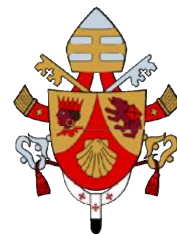
Coat of Arms for Benedict XVI