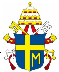
Coat of Arms for John Paul II

Shortly afterwards, a mass is celebrated in St. Peter's Square. Formerly at the mass the Pope was crowned with the papal crown, called the tri-regnum . It had three crowns to denote the fact that the pope was the leader of the church on earth, the church in purgatory, and the church gloriously reigning in the kingdom of heaven. Pope Paul VI was the last pope to be crowned. He sold the crown to offer assistance for the poor. It now sits in the Shrine of the Immaculate Conception in Washington, DC. Pope John Paul I, John Paul II, and Pope Benedict XVI all rejected the crown as part of the ceremony. It used to be a part of the Papal coat of arms, but Pope Benedict even abandoned crown on the coat of arms in favor of a Bishop's Mitre.